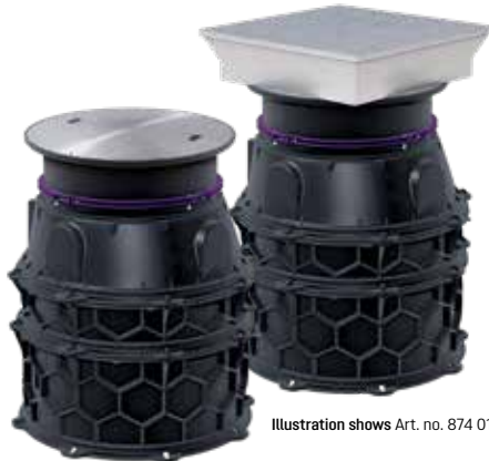
Illustration shows Art. no. 874 01 43

Note: Additional installation depths, upper sections and covers class B/D (on request)