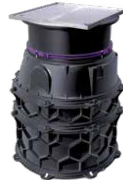
Illustration shows Art. no. 874 00 20