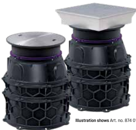
Illustration shows Art. no. 874 01 43

Note: Additional installation depths, upper sections and covers class B / D (on request)