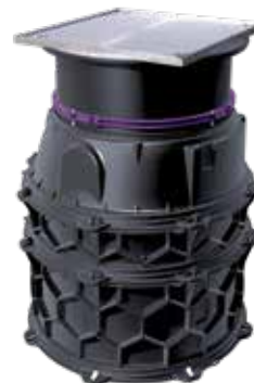
Illustration shows Art. no. 874 00 20