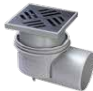
Illustration shows Art. no. 45 110.40 (lateral outlet)