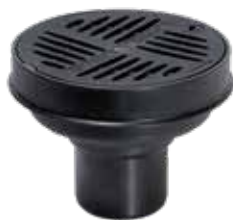
Illustration shows Art. no. 67 111B