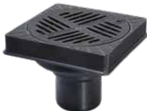
Illustration shows Art. no. 67 110B