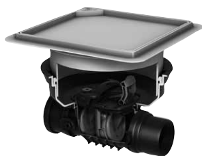
Figure shows art. no. 770 100.10X

Installation in the floor slab, beginning model year 09/2017