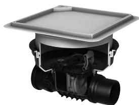
Figure shows art. no. 720 100.10X