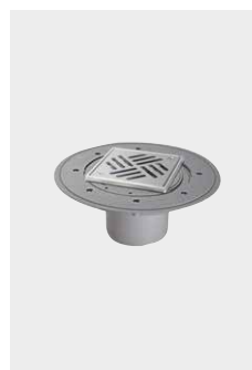
Variofix shallow bed upper section, screwed