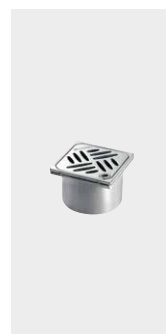
Upper section Kessel with Lock & Lift System