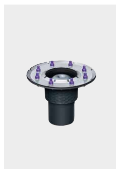
Floor drain Ecoguss with pressure sealing flange