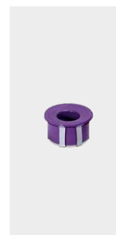
Fire protection insert Fire-Kit