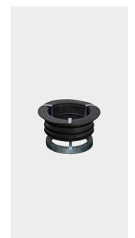
Passage seal Quick-Fit