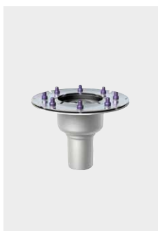
Floor drain Ferrofix